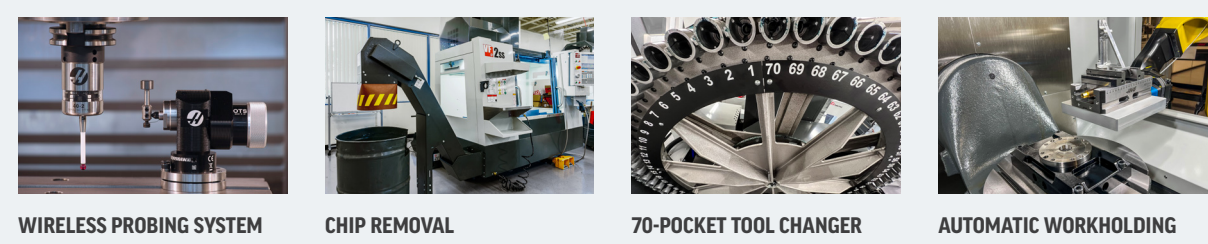
WIRELESS PROBING SYSTEM CHIP REMOVAL 70-POCKET TOOL CHANGER AUTOMATIC WORKHOLDING

Maximize production with these add-on features from Haas.